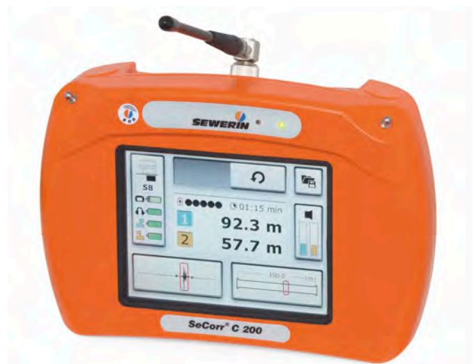
SeCorr® C 200 receiver