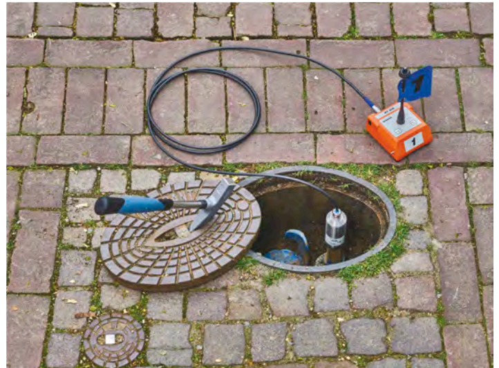
RT 200 radio transmitter with UM 200 microphone in use

The SeCorr® C 200 is lightweight and ergonomic. Its strong triangular belt enables it to be carried effortlessly. The compact, symmetrical housing means that it can be comfortably operated by right and left handers alike. Wireless communication between the receiver and headphones means that the user can work without annoying cables.