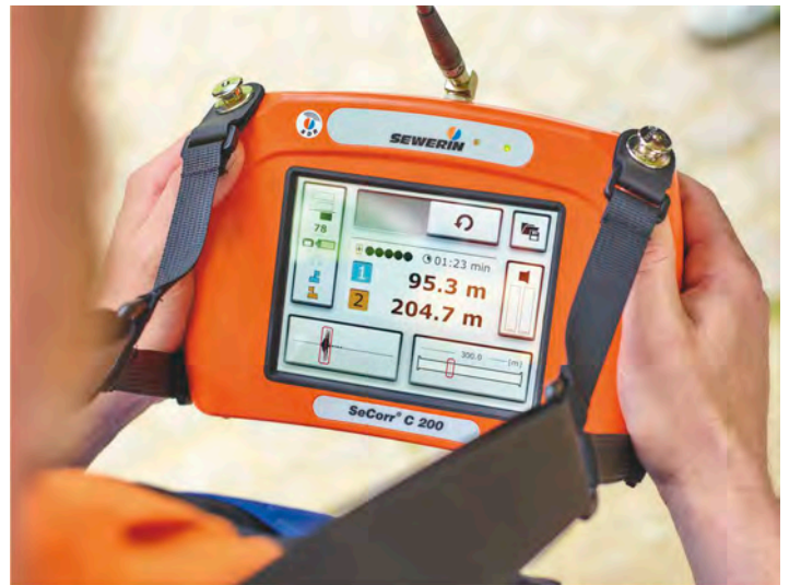
Measurement result shown on SeCorr® C 200 display