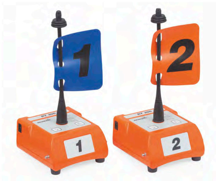
RT 200 radio transmitter

Thanks to the results-oriented view, the user can immediately implement further steps, e.g. confirm the location by acoustic means.